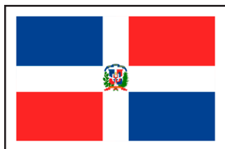
Dominican Republic National Team