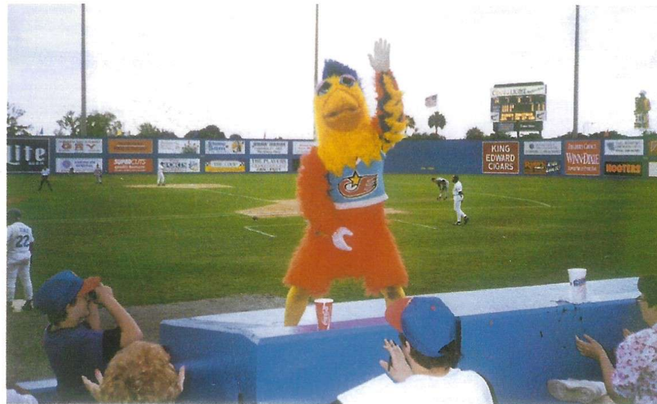
The Famous Chicken.