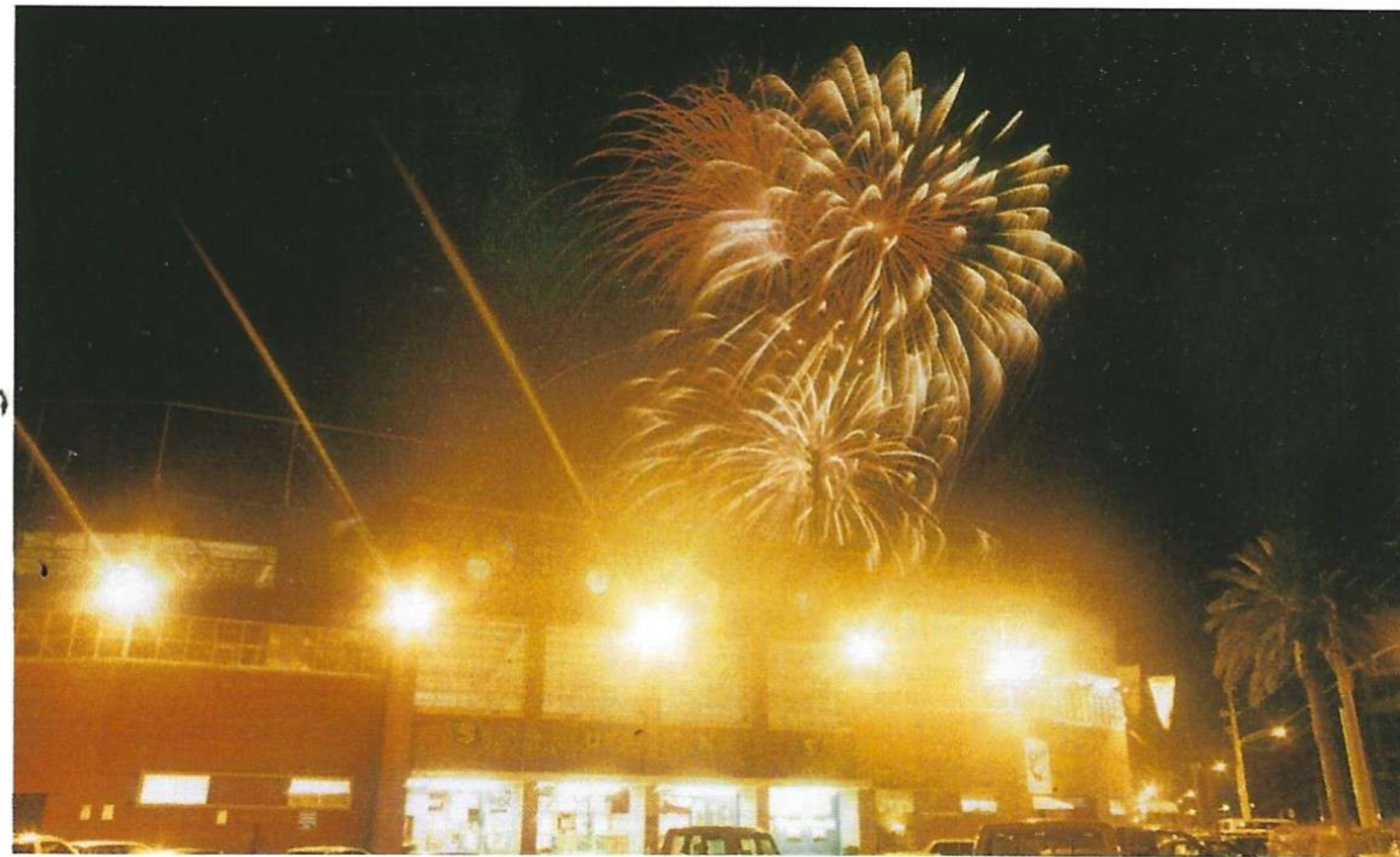
Fireworks always draw a huge crowd.

Sponsorship investments vary depending upon item, quantity, date, event and availability. Ask your Suns representative for further information about a promotional night for your company.