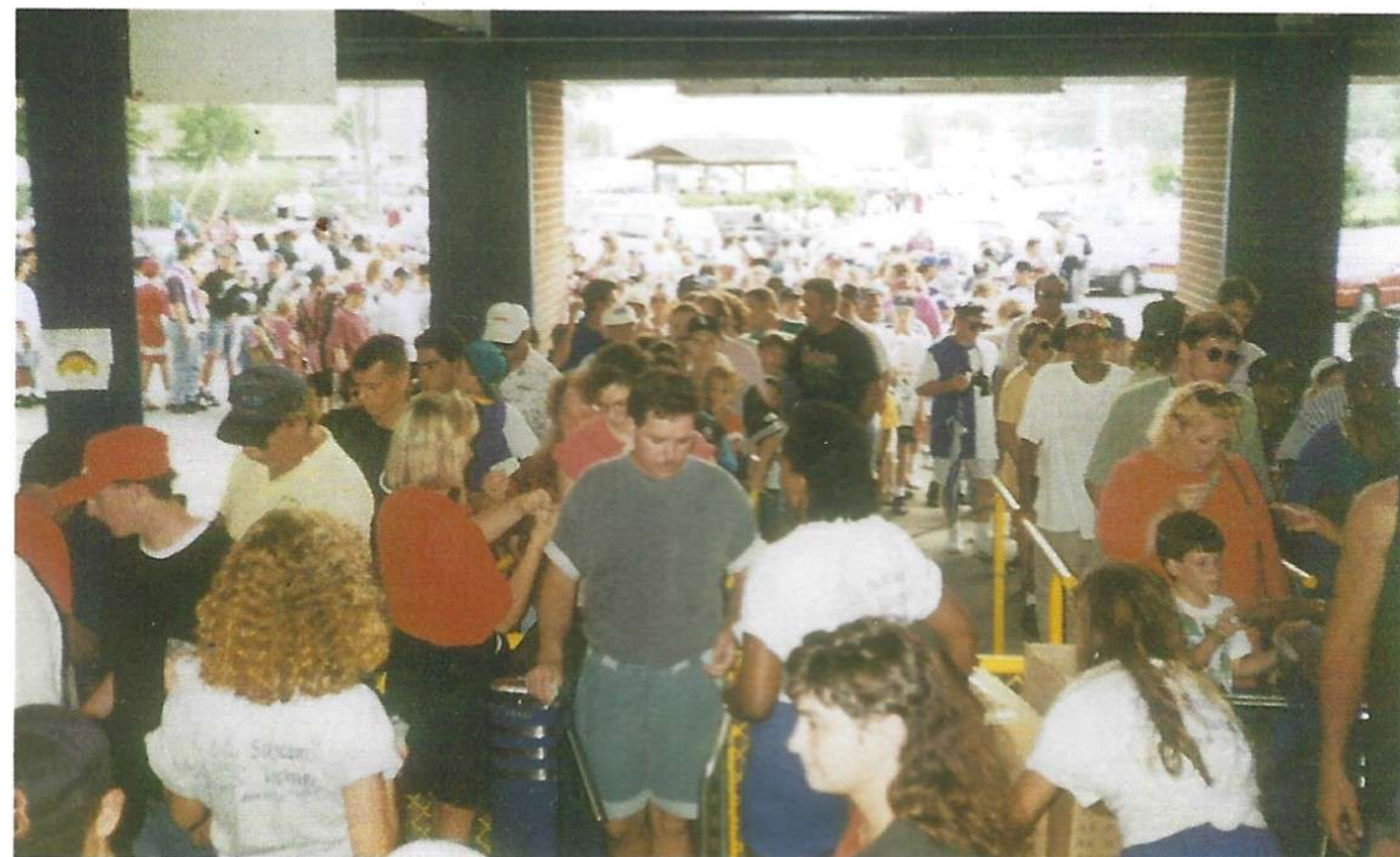
Fans line up early for another great giveaway item.