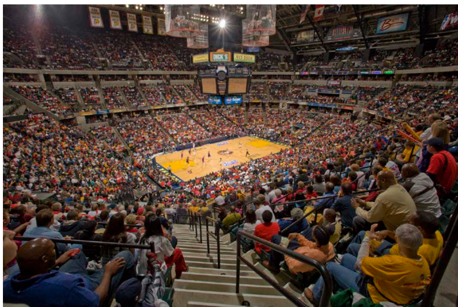
October 7, 2009: A capacity crowd of 18,165 looks on at Bankers Life Fieldhouse during Game 4 of the WNBA Finals between the Fever and Phoenix Mercury. Indiana led the series 2-1 with a chance to win its first WNBA crown before this throng of onlookers. Phoenix won the game, 90-77, and captured the title two nights later in Phoenix.

17,313 at Phoenix, 10/9/09 16,758 at Phoenix, 10/1/09 16,682 at New York, 9/1/10 14,624 at New York, 8/26/10 14,322 at Minnesota, 10/14/12 13,478 at Minnesota, 10/17/12 12,471 at New York, 8/20/02 11,617 at Phoenix, 9/29/09 10,988 at New York, 8/18/02 10,153 at Detroit, 9/2/03 9,856 at Detroit, 8/3/03 8,830 at Detroit, 8/19/06 8,508 at New York, 9/17/11 8,296 at Detroit, 9/23/08 8,219 at Detroit, 9/21/08 7,729 at New York, 8/30/05