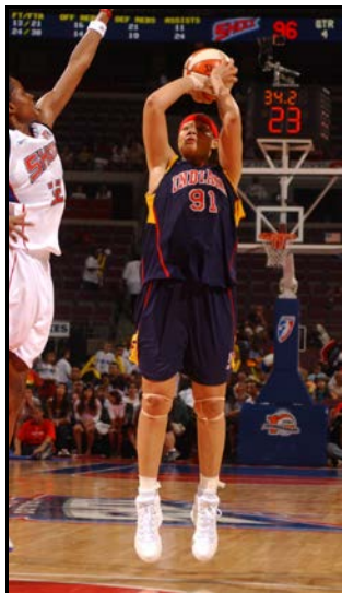
Tamika Whitmore's 41 points for Indiana in a 98-83 playoff loss at Detroit, 8/19/06, was a WNBA Playoff record until 2010. Whitmore made 15-of-22 shots and added 10 rebounds in what was one of the greatest playoff performances in league history. Pacing the Fever while Tamika Catchings was lost for the second half due to a concussion, Whitmore scored 25 points in the second half, including 15 in the third quarter.