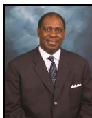
QUINN BUCKNER COMMUNICATIONS