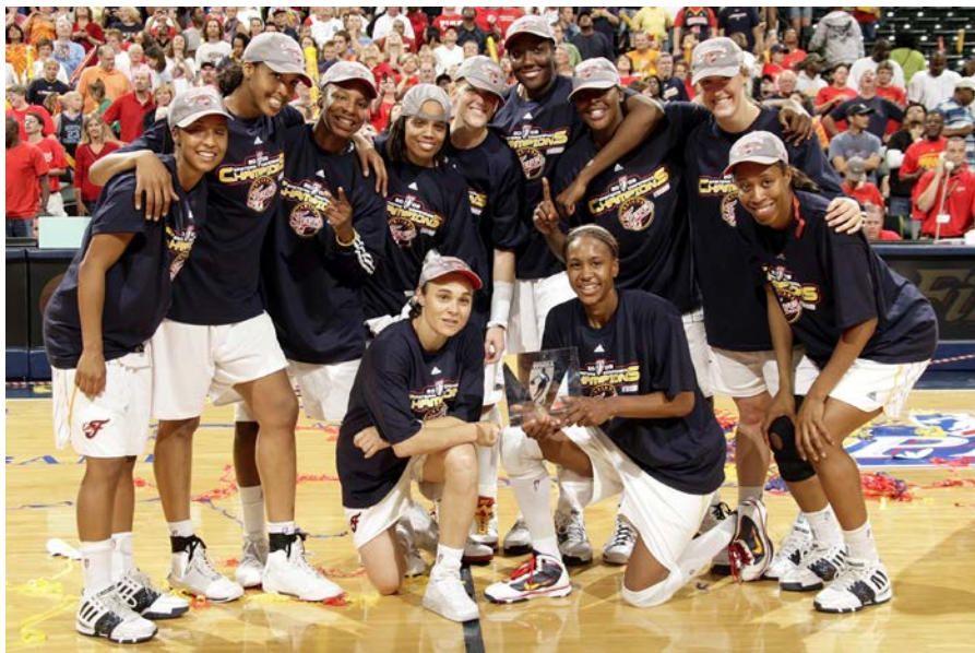
The Eastern Conference Champions in 2009, the Fever beat Detroit to end three straight years of playoff elimination by the Shock. The championship game at Bankers Life Fieldhouse wound up being the Shock's final game before moving its franchise to Tulsa.