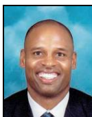
CLARK KELLOGG PLAYER RELATIONS