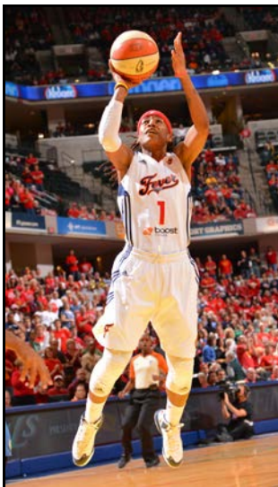
Shavonte Zellous' 30 points in Game 3 of the 2012 WNBA Finals matched the third-highest scoring output in Indiana playoff history. Zellous hit 10-of-17 shots in the game while staking the Fever to a stunning 37-point third-quarter advantage (70-33), which is the largest lead in Finals history. Zellous shot 18-of-18 from the FT line during the series and closed the 2012 campaign with 19 straight free throws made.