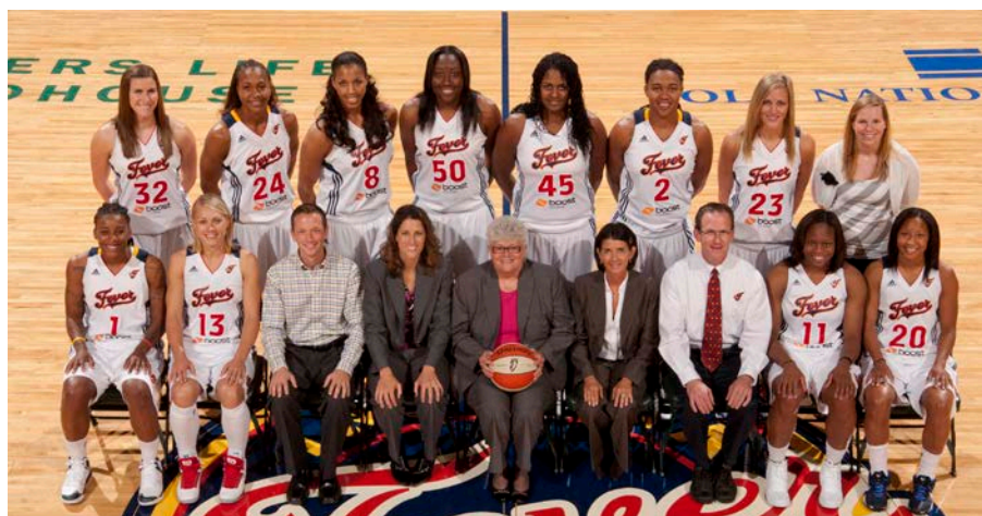
2012 Indiana Fever