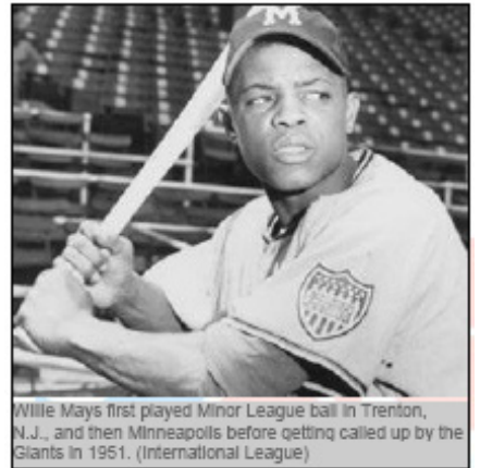
Willie Mays first played Minor League ball in Trenton, N.J., and then Minneapolis before getting called up by the Giants in 1951.