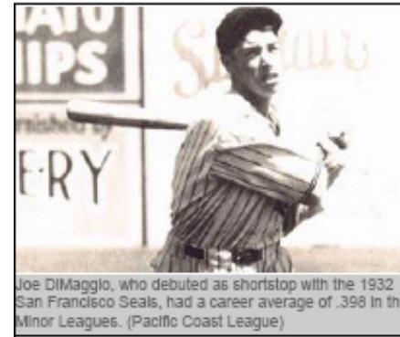
Joe DiMaggio, who debuted as shortstop with the 1932 San Francisco Seals, had a career average of .398 in the Minor Leagues. (Pacific Coast League)