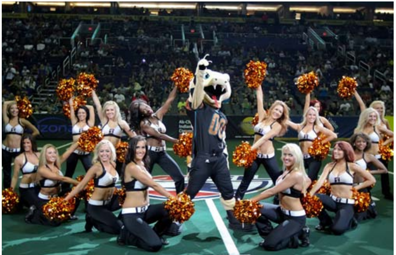
» Sidewinders Dancers

Baker is a veteran cheerleading instructor and judge for USA Cheer.