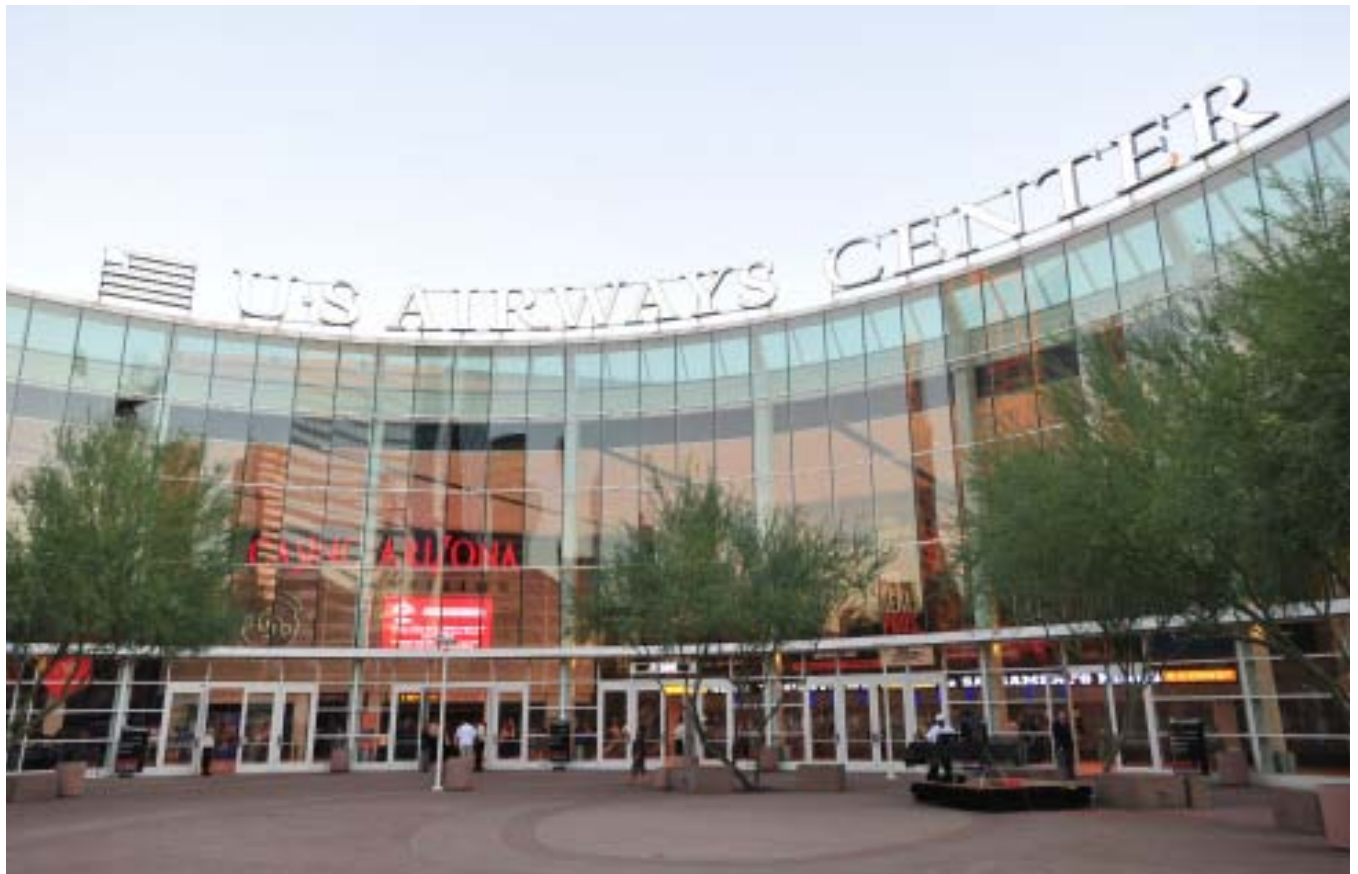
» US Airways Center

US Airways Center seats 14,398 for Rattler's games.