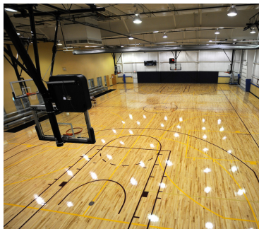
EDGEWOOD COMMUNITY CENTER