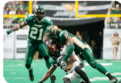
The SaberCat defense forced Orlando to turn the ball over four times on downs