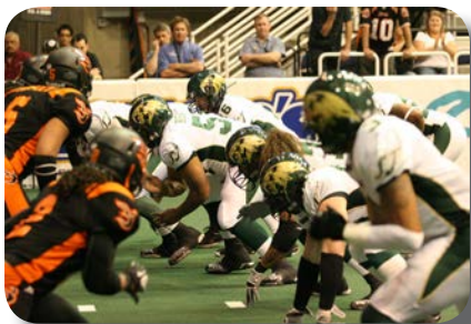
The SaberCats offense was able to put up 68 points, but couldn't come up with the victory