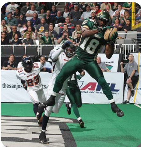
WR Nichiren Flowers TD Catch