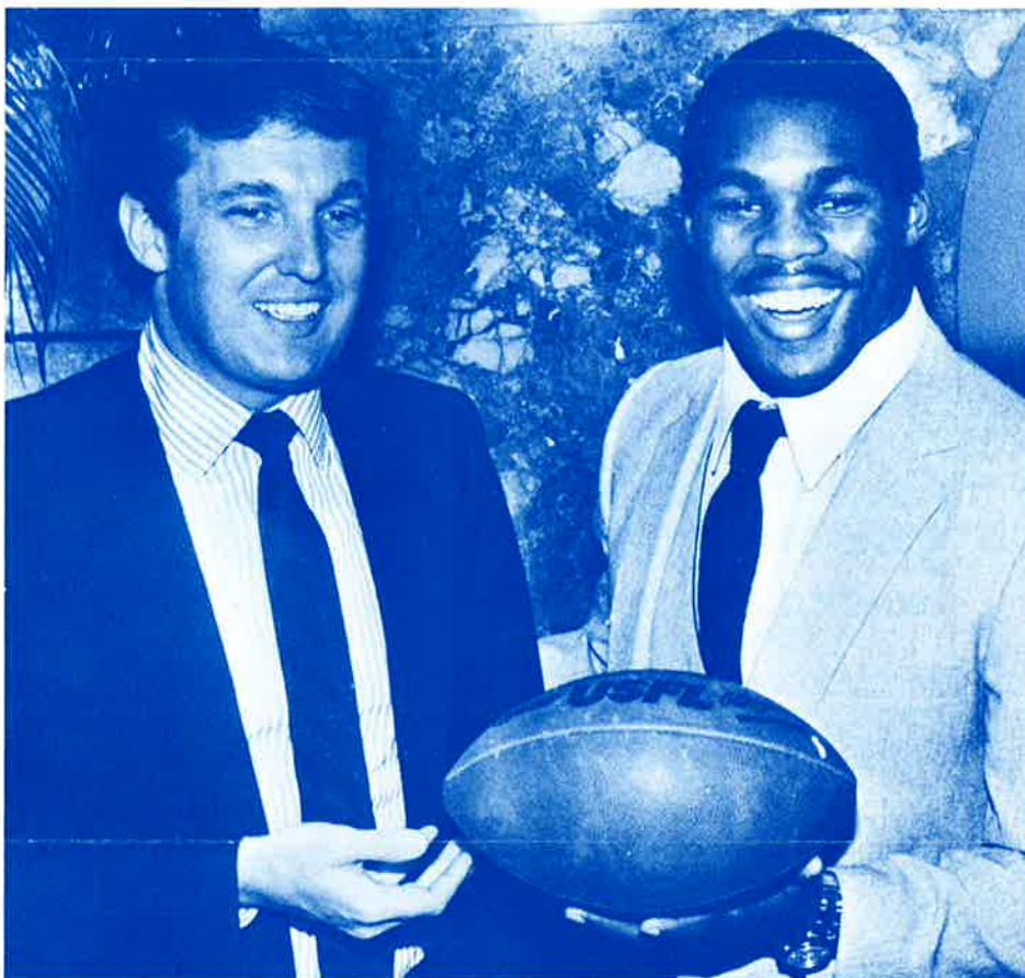
Generals Owner Donald Trump hands the ball off to superstar Herschel Walker .

The main thing is that we are here to stay. What the Dallas Cowboys did by not drafting Herschel Walker until the fifth round of the NFL draft is the greatest affirmation that we are here to stay. When they don't make a serious pick for the greatest player ever to come out of college, they are telling you what they really think — by action, not by words. This is the biggest compliment they could have