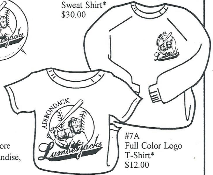
#7A Full Color Logo T-Shirt* $12.00