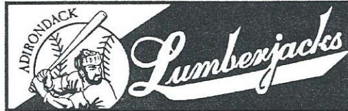
#2A - 2 Color Logo Bumper Sticker - $1.25