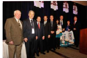
Class of 2015

Only members of the Selection Committee, the Board of Governors, teams or persons affiliated with the ECHL may submit official nominations which must be made in writing to the league office. Fans are encouraged to contact their team to propose names for nomination.