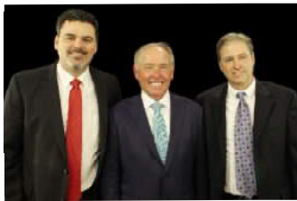
Class of 2016

No more than five candidates may be elected to the ECHL Hall of Fame each year with no more than three Players, one Developmental Player, two Builders and one Referee/Linesman. The Builder and the Referee/Linesman categories are dependent upon the number of candidates in the Player category.