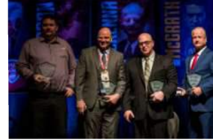
Class of 2019

In conjunction with the celebration of its 20th Anniversary in 2007-08, the ECHL announced the formation of the ECHL Hall of Fame.