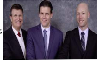
Class of 2017

Hall of Fame members will be selected in four categories: Player, Developmental Player, Builder, and Referee/Linesman. Players must have concluded their career as an active player for a minimum of three playing seasons, though not continuous or full seasons. Developmental Players must have begun their career in the ECHL and went on to a distinguished career in the NHL, playing a minimum of 260 regular season games in the NHL, AHL and ECHL. Builders may be active or inactive whereas Referee/Linesman must have concluded their active officiating career for a minimum of three playing seasons.