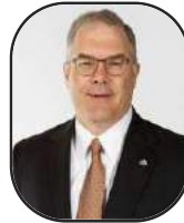
Lamar Hunt, Jr. Kansas City