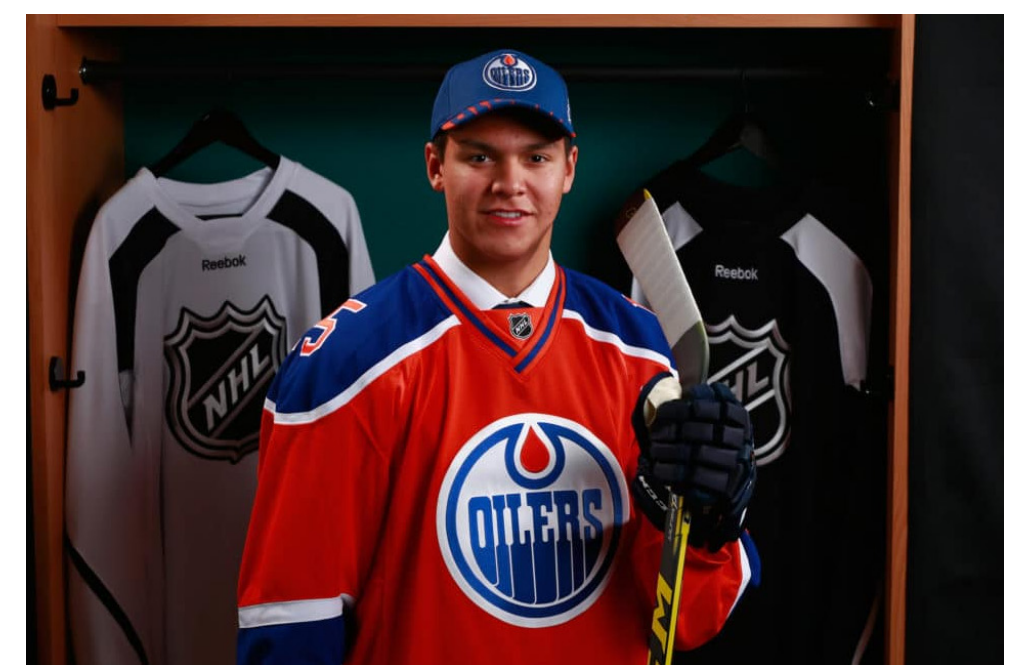
Ethan Bear is one of just five players taken in the 5th round of the 2015 Draft who have already skated in the NHL.