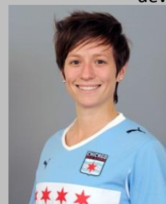
Megan Rapinoe Position: Midfielder No. 8 Height: 5'7" College: University of Portland Country: USA

Cristiane was selected by the Red Stars in the first round (fifth overall) of the 2008 WPS International Draft. In her 2009 WPS season, Cristiane led the Red Stars with seven goals and recorded the first and only hat trick in WPS history during a 3-1 win over FC Gold Pride on July 12, 2009. She was named to the WPS All-Star Team. Cristiane finished third in FIFA Player of the Year voting in 2007 and 2008. She was a silver medalist for the Brazil National Team at the 2004 and 2008 Olympics and was the leading scorer at the '08 Olympics with five goals.