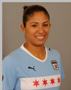
Cristiane Position: Forward No. 11 Height: 5'6" Country: Brazil

Karen Carney was selected in the third round (19th overall) by the Red Stars in the 2008 WPS International Draft. She was the team's first official signing in January 2009. In her first WPS season, Carney had two goals and an assist in 17 games. She was voted the 2009 Red Stars MVP by select team staff and local media following the season. Carney made her English National Team debut in February 2005 at the age of 17. In 2009, Carney had a tournament-high four assists during England's runner-up finish in the UEFA Women's Championship. She was a member of England's 2007 FIFA World Cup team.