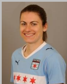
Karen Carney Position: Forward No. 14 Height: 5'3" Country: England

Karen Carney was selected in the third round (19th overall) by the Red Stars in the 2008 WPS International Draft. She was the team's first official signing in January 2009. In her first WPS season, Carney had two goals and an assist in 17 games. She was voted the 2009 Red Stars MVP by select team staff and local media following the season. Carney made her English National Team debut in February 2005 at the age of 17. In 2009, Carney had a tournament-high four assists during England's runner-up finish in the UEFA Women's Championship. She was a member of England's 2007 FIFA World Cup team.