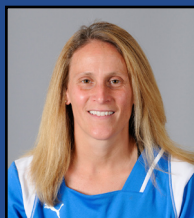
13 - Kristine Lilly