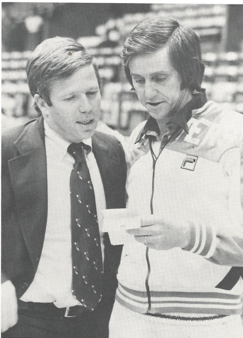
Lobsters' President Robert Kraft and Player/Coach Roy Emerson