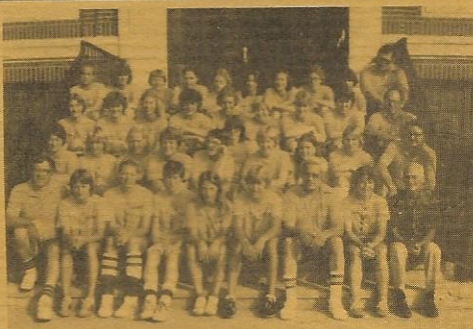
Participants of the Iowa Cornets Junior High and High School basketball camp.