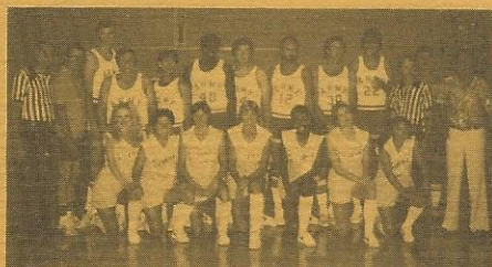
Scenes during the filming of the Hollywood movie "Dribble" featuring three Iowa Cornets players and NBA star Pete Maravich.

Pre-game and halftime shows will include world class performers and entertainers.