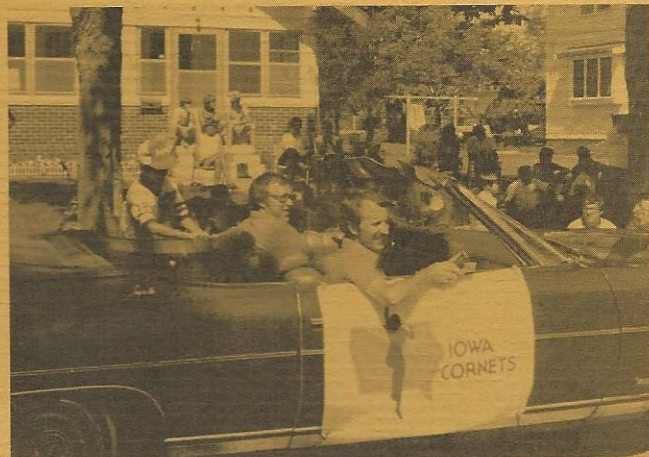
The Iowa Cornets parading during the Fun and Feed days in Ankeny, Iowa.